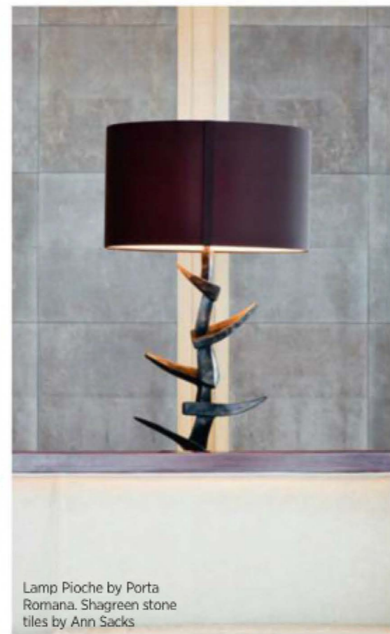
Lamp Pioche by Porta Romana. Shagreen stone tiles by Ann Sacks

of 1950's Monaco; spacious kitsch-free interiors inspired by the sea and marina, but fastidiously avoiding common clichés such as starfish, anchors and driftwood; instead using sophisticated, subtle materials, like shagreen wall panels and marine grade high-gloss teak. Most importantly I wanted the design to be entirely unique, stylish and timeless, and not look like it had been 'designed' by an interior designer."