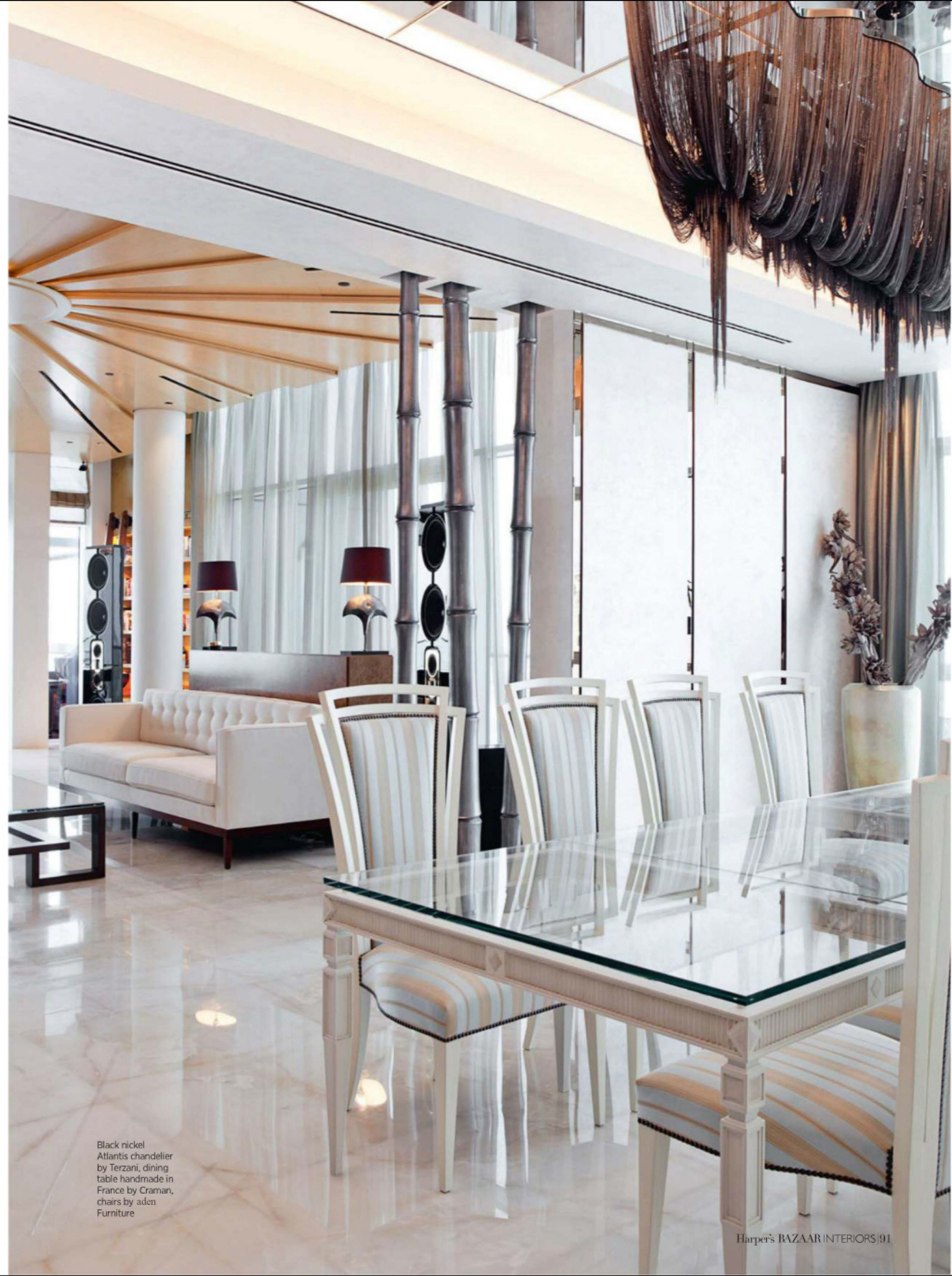
Black nickel Atlantis chandelier by Terzani, dining table handmade in France by Craman, chairs by aden Furniture