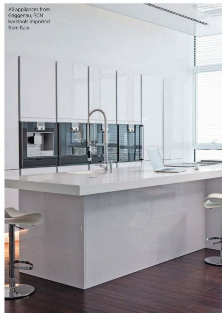
All appliances from Gaggenau, BCN barstools imported from Italy