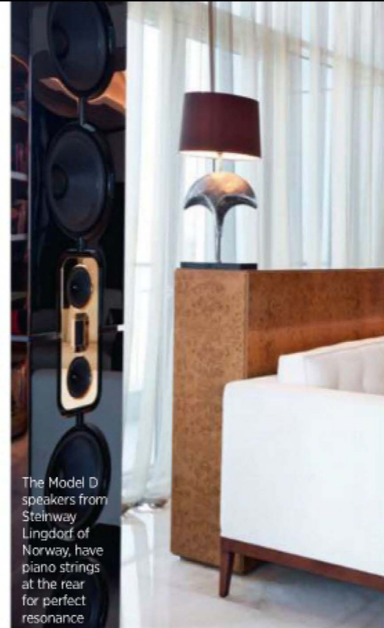
The Model D speakers from Steinway Lingo of Norway, have piano strings at the rear for perfect resonance