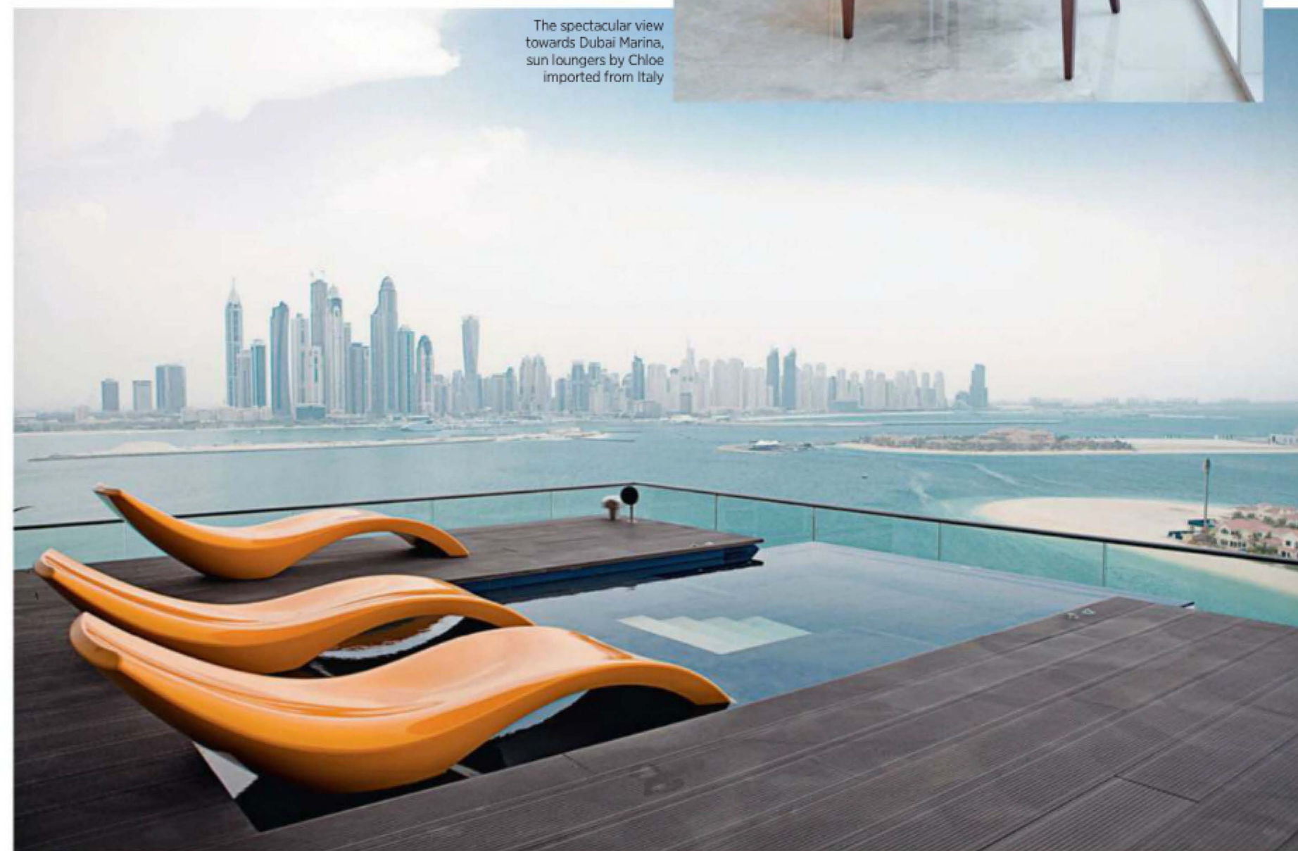
The spectacular view towards Dubai Marina, sun loungers by Chloe imported from Italy